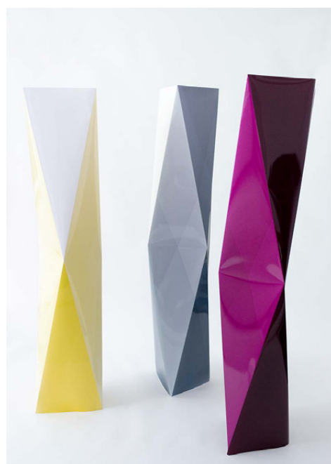
Stefanie Seufert, Towers, Option #2, 2016