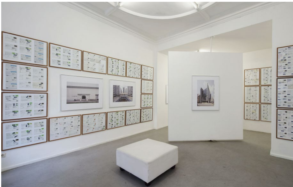
Roland Geissel "500 Postcards", COPYRIGHTprojektraum 2015